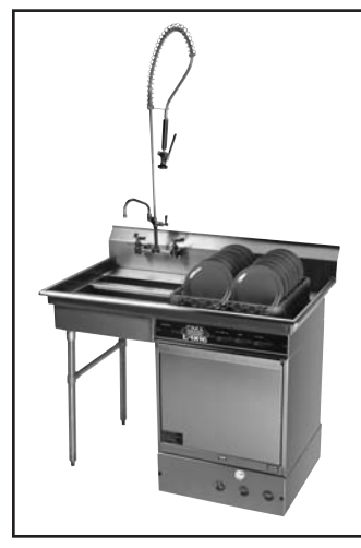
Optional dishtable, faucet and pre-rinse unit sold separately.