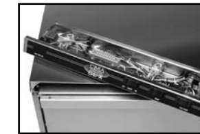
"Works-in-a-drawer". All electrical components are attached to a sliding drawer for easy access and service.