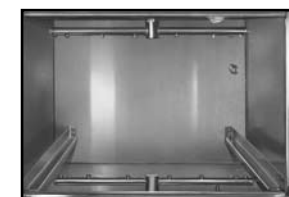
Upper and lower rotating wash arms guarantee excellent results.