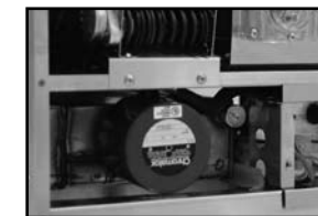
"Built in" Hot Water Assurance System provides hot water every cycle.