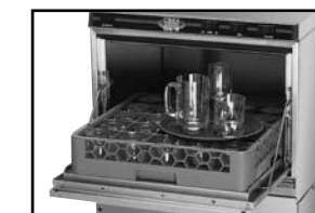
Uses standard 19-3/4"X 19-3/4" racks. Large 11-1/4" glass clearance.